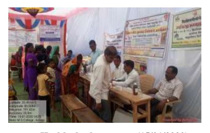
Health check up camp (15/01/2020)