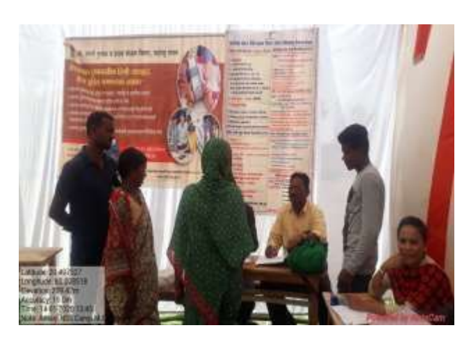
Government at villeger door, Bank facilities camp (14/01/2020)