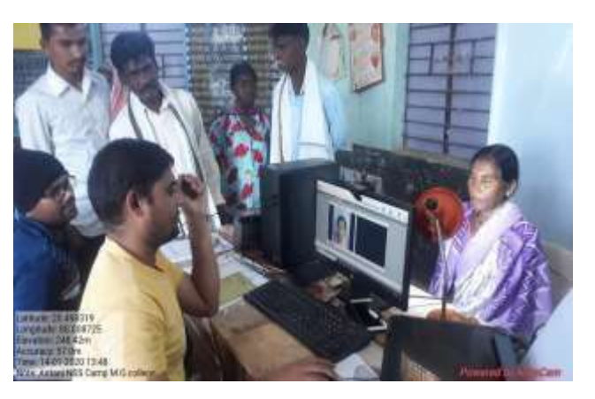
Organised Aadhar card camp (14/01/2020)